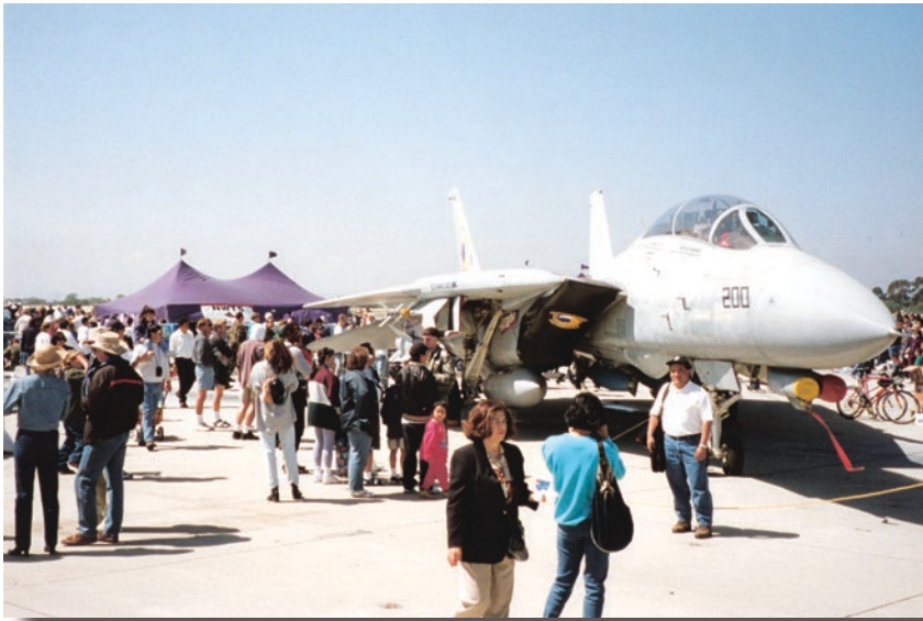
Naval Base Ventura County Air Show & community support

The Regional Defense Partnership - 21st Century is Ventura County's community organization to support and maximize the assets of the county's military commands and defense contractors, with total of more than 17,000 military, federal civilian and contractor employees and generate $1.99B annually.