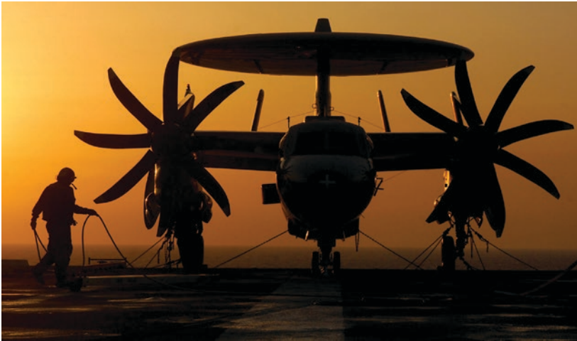
Deployed Pt Mugu E-2 Squadron

More than 5100 federal civilian employees at Naval Base Ventura County make a tremendous contribution to the nation's military capabilities. Most of these federal jobs are scientists and engineers in applied research and development and technology-related positions.