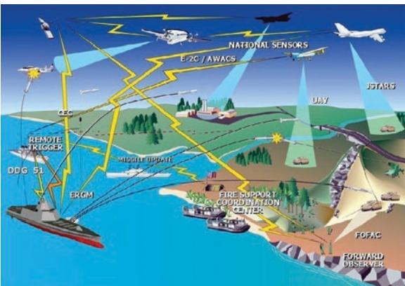
Sea, Land, Air & Space defense assets interconnect at NBVC

Linkages throughout the western test ranges enable virtual and network-centric warfare capabilities for test and evaluation in nearly all theater warfare scenarios. These ranges include Naval Air Warfare Center, Weapons Division, China Lake; Edwards Air Force Base; Naval Surface Warfare Center, Port Hueneme Division, White Sands Detachment; and Vandenberg Air Force Base.