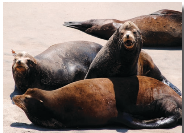
Military Missions & Nature co-exist at NBVC

NBVC is a leader in the Navy's "Green Fleet" initiatives and has received numerous national awards for environmental protection and energy management. It has reduced energy levels for shore installations through alternate energy means, infrastructure improvements and management oversight.