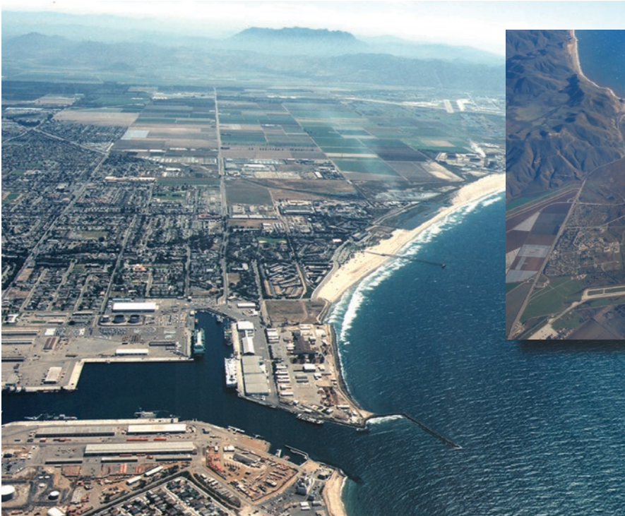
Pt Hueneme Harbor (foreground) & NAS Pt Mugu (background)