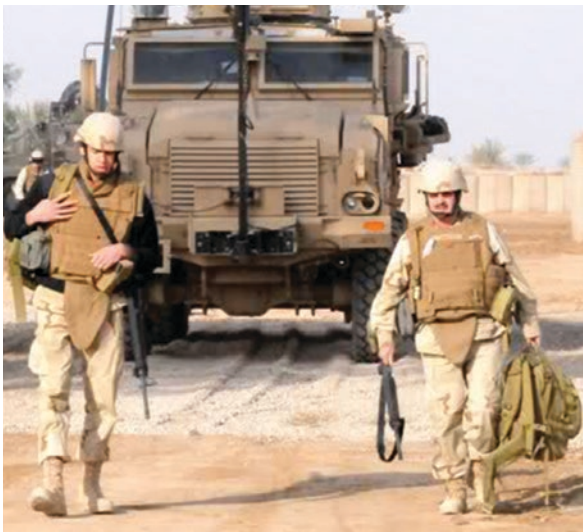
Hueneme Sea Bees deployed in Iraq

NBVC commands include the Naval Air Warfare Center, Weapons Division; Naval Surface Warfare Center, Port Hueneme Division; and the Naval Test Wing Pacific. These commands provide comprehensive capabilities including expertise in test and evaluation engineering and execution. Here, world-class knowledge and experience plays out across extensive Navy-controlled air and sea range; off-shore island test sites; Electronic Warfare Development and support;