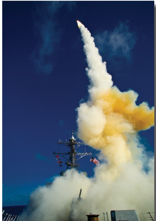
Surface firing on test range