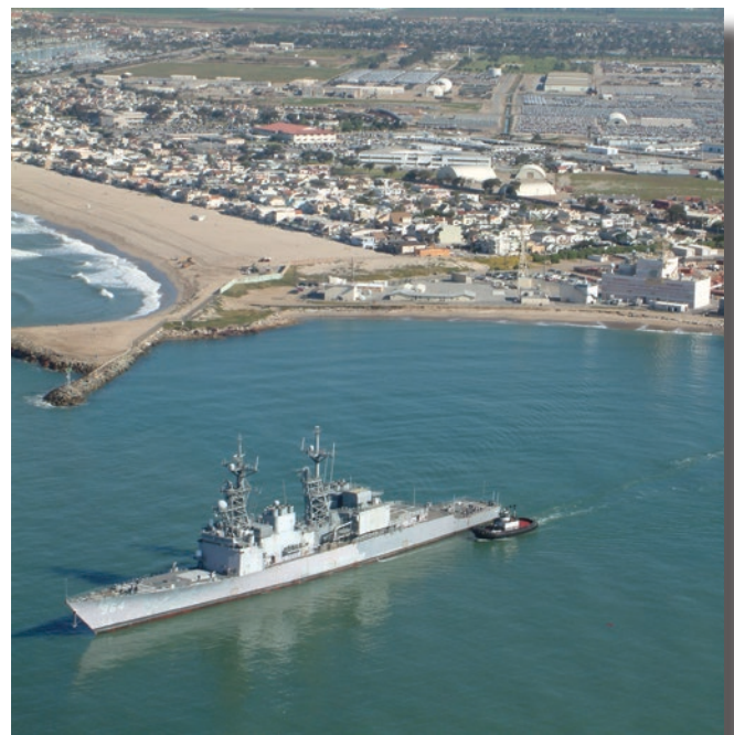
Test Ship (foreground) & Surface Warfare Engineering Facility (background) in Pt Hueneme Harbor

Naval Base Ventura County, made up of 90+ individual organizations, creates jobs for civilians, promotes high-tech growth in the county and sustains a variety of local businesses through military contracts. With more than 17,000 military, federal civilian and contractor employees, the Navy is by far the largest employer in the county.