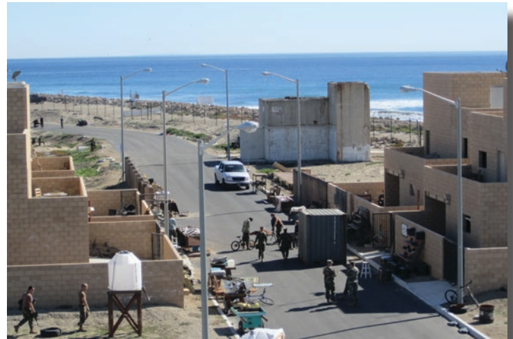
Pt Mugu- Middle East Joint Training Village

Directed Energy and Unmanned Aerial Systems projects; and leading-edge land, sea and air threat and target presentations, including a Spruance-class self-defense test ship. The Naval Facilities Engineering Service Center provides specialized engineering services, technology testing and facilities expertise to global DOD operations.