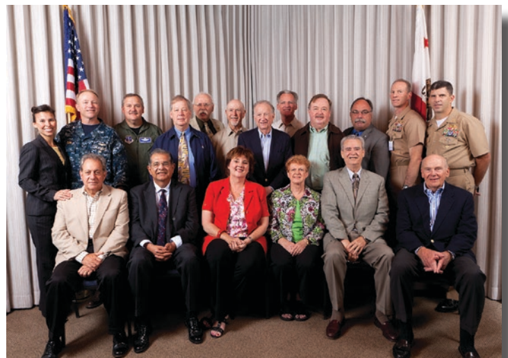
Ventura County Government, Military & Business leaders of RDP-21