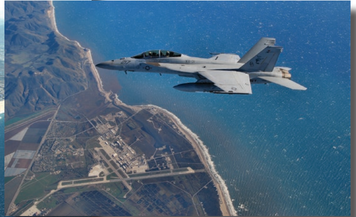
F/A-18 over NAS Pt Mugu

Supportive communities ensure an unencroached operating environment.